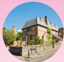
Left: Kings Oxford, set 15 minutes from the city centre

Note: You must show that your level of English is good enough to follow the course. If you have not taken IELTS or TOEFL or a similar exam, you can complete our English Language Suitability Test. This is not a substitute for these exams but it will help us assess your ability to follow the course. Kings can offer you one of a range of English language courses, depending on your needs.