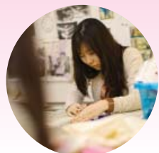
Left and right: Students working on projects in the art studio